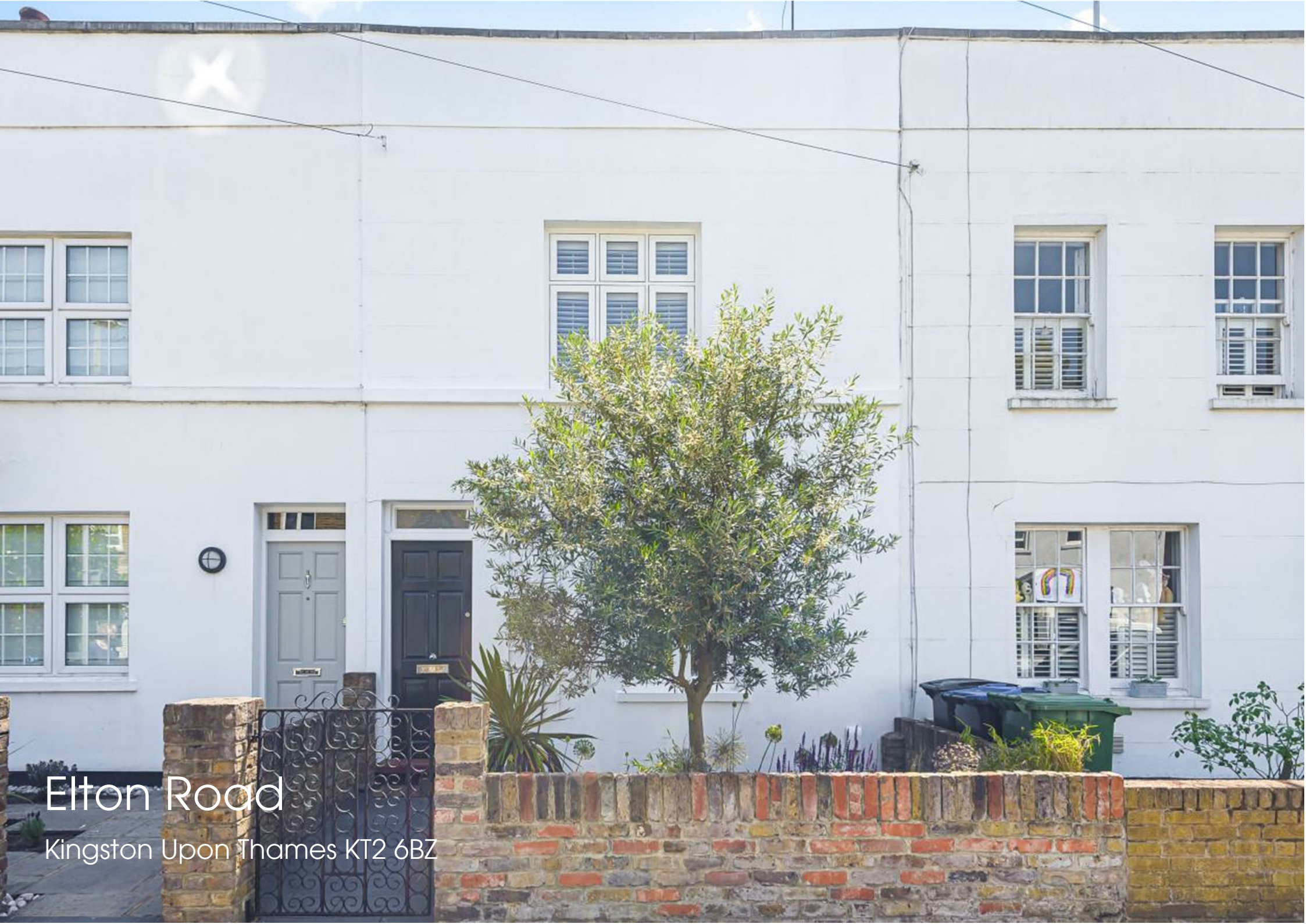
Elton Road Kingston Upon Thames KT2 6BZ